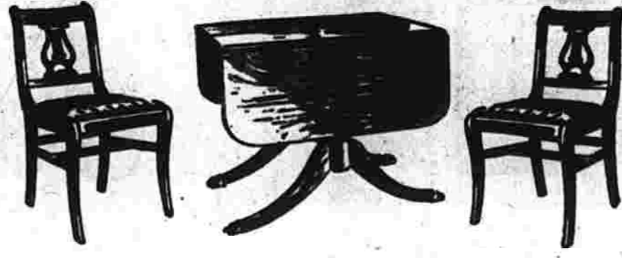
Table and 4 Chairs only 98.00

At dinner time you clear the table of its living room accessories raise the leaves to seat four, or open the extension with its concealed leaf to seat six! Four Duncan Phyte side chairs are included! Formerly $115.00.